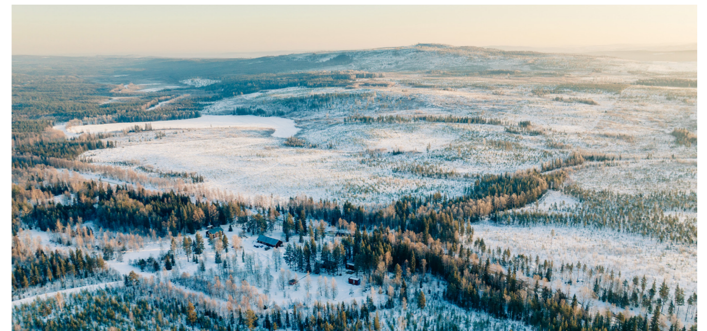
RETURN OF THE YAK: [above] The Torridon in the Scottish highlands offers the chance to get back to nature; remote, unspoiled beauty in Swedish Lapland

high-tech shower recycles water immediately back into the shower system, ensuring minimal wastage. Waste is handled by a mini treatment plant that exceeds the strict guidelines from the Swedish Environmental Protection Agency. The main heating in the lodge and the extra bedroom unit is via an energy-efficient air source heat pump, and >