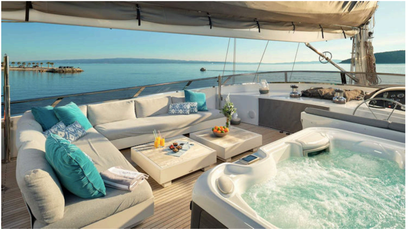
San LiMi yacht