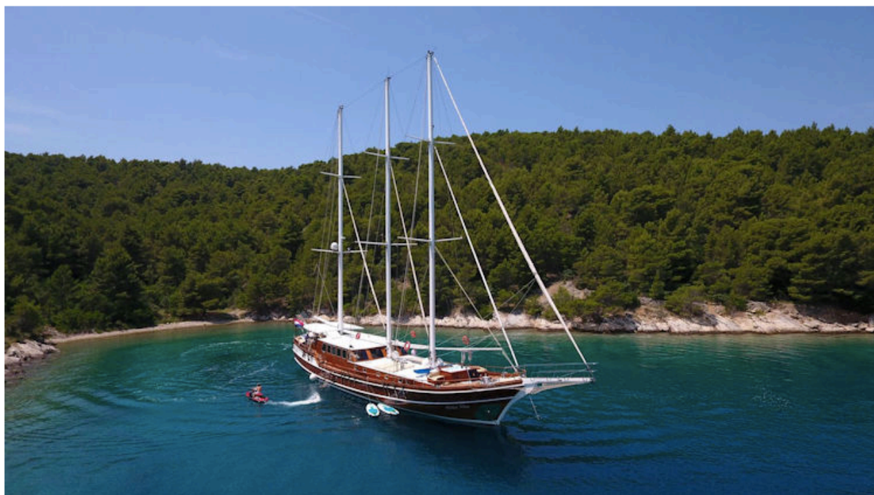
Dolce Vita Gulet, Hvar Island

Starting off in Split, which is serviced by an International airport, we visited Diocletian's Palace, a Unesco World Heritage Site and one of the world's most impressive Roman monuments. Setting off on the turquoise waters of the Adriatic, we then stopped on the island of Vis, an ex-military masterpiece that only opened to tourists in the 1990s: after a stop at the Blue Cave, we gained a fascinating insight into the role the island played in WWII on a round-the-island tour with Goran, our guide, reaching the island's highest peak and areas not accessible by foot.